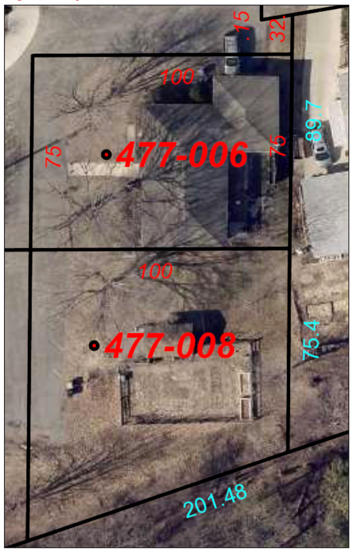
https://beacon.schneidercorp.com/Application.aspx? AppID=387& LayerID=5678& PageID=1& PageID=0