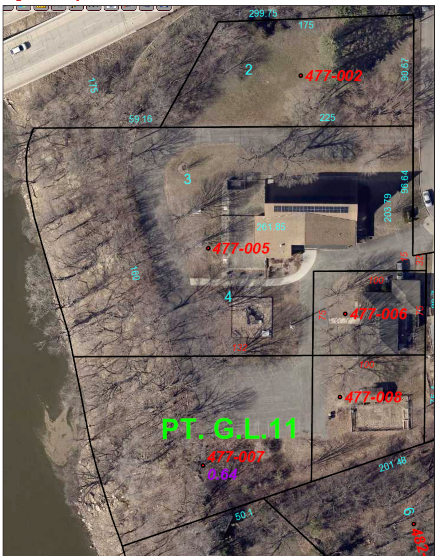
https://beacon.schneidercorp.com/Application.aspx? AppID=387 & LayerID=5678 & PageID=1 & PageID=0